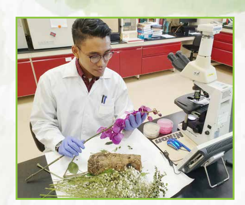
Microscopic identification of bacteria and fungi