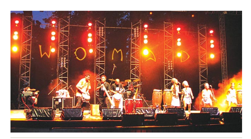
Hosting a range of performances and events, Fort Canning Park attracted some 500,000

For the year in review, some 3,600 performances and events delighted visitors to our many parks. NParks continued to partner world-class talent to use our parks as performance spaces, thereby adding to our park users' enjoyment and quality of life by giving them an expanded range of high-quality entertainment options.