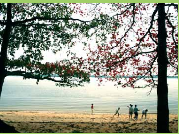
West Coast Park